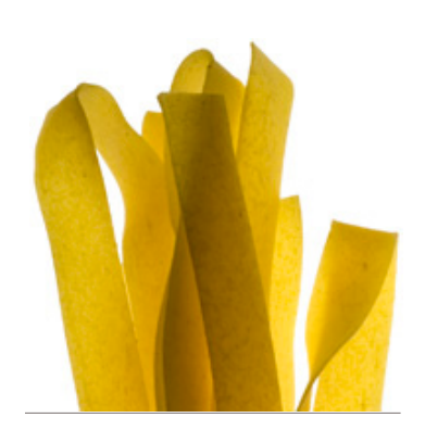
PAPPARDELLE SAUCES: Meat