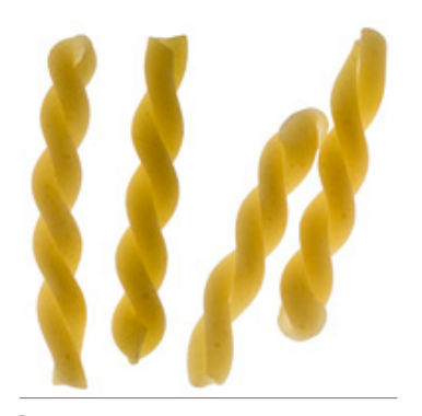
GEMELLI SAUCES: Baked, Butter/Oil, Cream/Cheese, Meat, Pasta Salad, Pesto, Soup, Vegetable