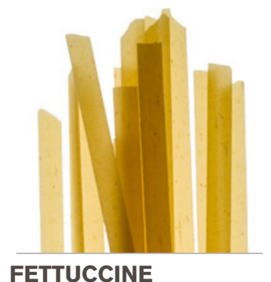
SAUCES: Butter/Oil, Cream/ Cheese, Meat, Seafood, Tomato, Vegetable