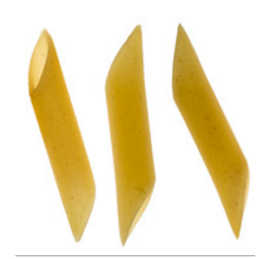
PENNE LISCE (a.k.a. Mostaccioli) SAUCES: Baked, Cream/ Cheese, Meat, Tomato, Vegetable