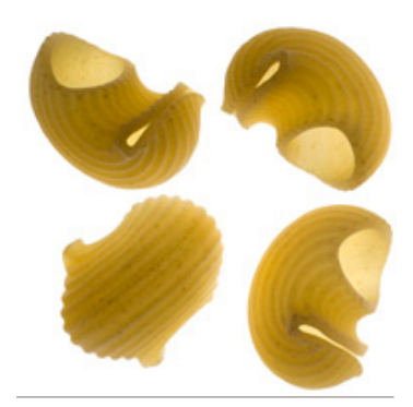
CONCHIGLIE SAUCES: Cream/Cheese, Meat, Pasta Salad, Pesto, Tomato, Vegetable