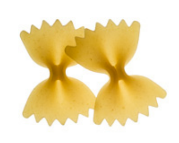
FARFALLE SAUCES: Butter/Oil, Cream/ Cheese, Meat, Pasta Salad, Pesto, Seafood, Soup, Tomato, Vegetable