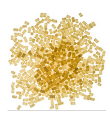
PASTINA SAUCES: Soup