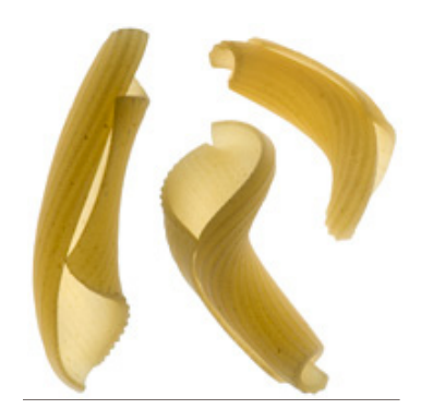
RICCIOLI SAUCES: Baked, Pasta Salad, Tomato