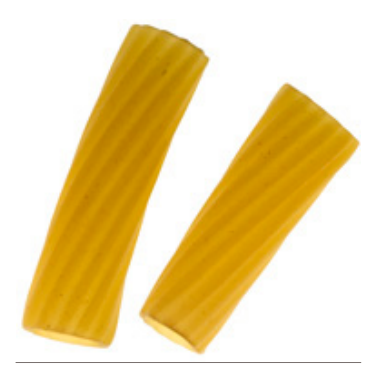
RIGATONI SAUCES: Baked, Cream/ Cheese, Meat, Tomato, Vegetable