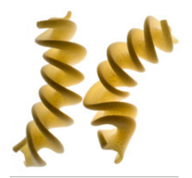
FUSILLI SAUCES: Baked, Butter/Oil, Cream/Cheese, Meat, Pasta Salad, Pesto, Soup, Tomato, Vegetable