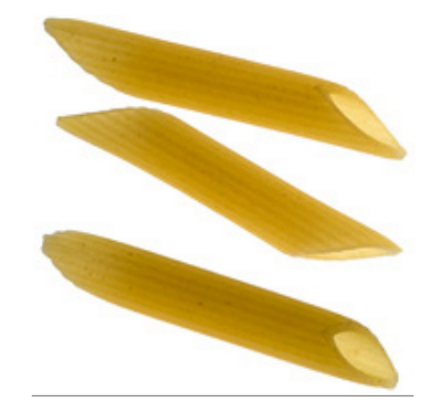
PENNE RIGATE SAUCES: Baked, Butter/Oil, Cream/Cheese, Pasta Salad, Tomato, Vegetable