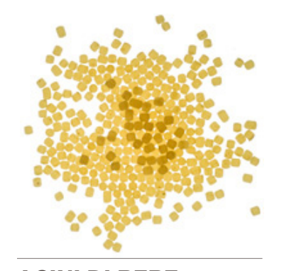
ACINI DI PEPE SAUCES: Soup

Here's a guide to help you tell your paccheri from your penne, your rotelle from your rotini. For more info on the sauces for each pasta, go to www.chow.com / stories / 11099.