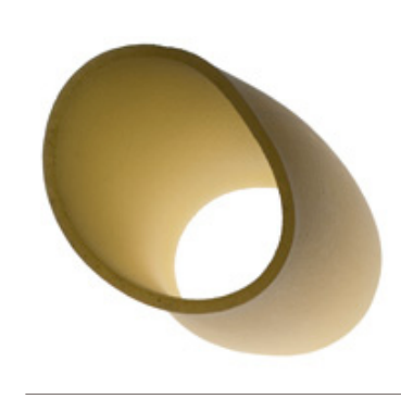
PACCHERI SAUCES: Tomato, Vegetable