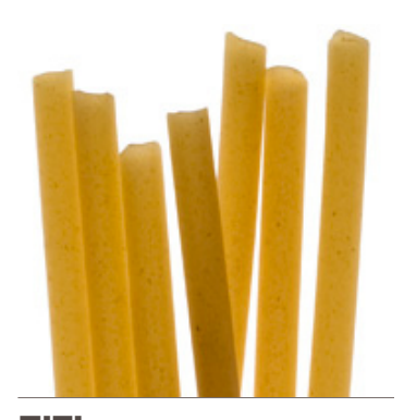
ZITI SAUCES: Baked, Butter/Oil, Cream/Cheese, Meat, Pasta Salad, Tomato, Vegetable