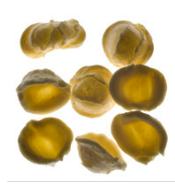
ORECCHIETTE SAUCES: Meat, Pasta Salad, Pesto, Tomato, Vegetable