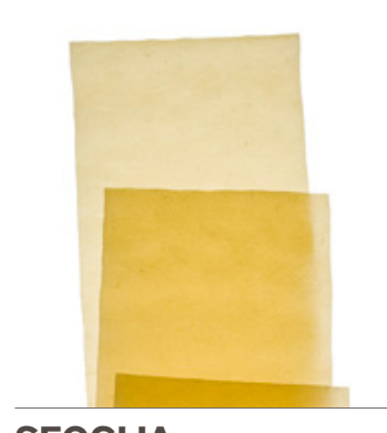
SFOGLIA SAUCES: Baked, Meat, Tomato, Vegetable