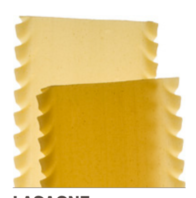
LASAGNE SAUCES: Baked, Cream/ Cheese, Meat, Tomato, Vegetable