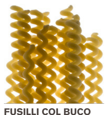
SAUCES: Baked, Butter/Oil, Cream/Cheese, Meat, Pasta Salad, Pesto, Soup, Tomato, Vegetable