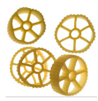
ROTELLE SAUCES: Baked, Cream/ Cheese, Meat, Pasta Salad, Soup, Tomato, Vegetable