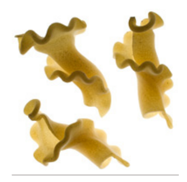
GIGLI SAUCES: Baked, Butter/Oil, Meat, Tomato