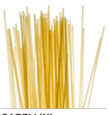
CAPELLINI (a.k.a. Angel Hair) SAUCES: Butter/Oil, Cream/ Cheese, Pesto, Seafood, Soup, Tomato, Vegetable