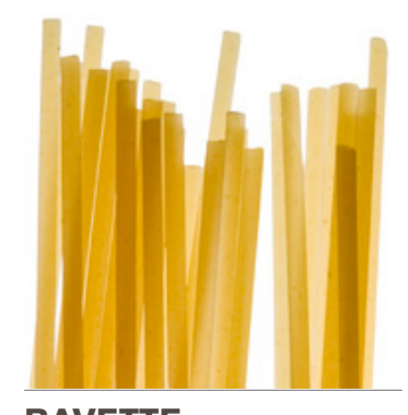
BAVETTE SAUCES: Pesto, Seafood, Tomato