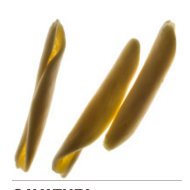
CAVATURI SAUCES: Pasta Salad, Vegetable