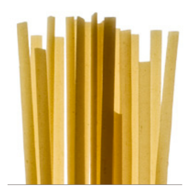
TAGLIARINI SAUCES: Butter/Oil, Cream/Cheese