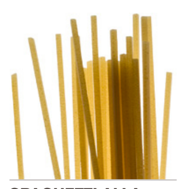
SPAGHETTI ALLA CHITARRA SAUCES: Baked, Butter/Oil, Cream/Cheese, Meat,