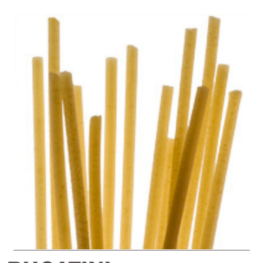
BUCATINI SAUCES: Baked, Tomato