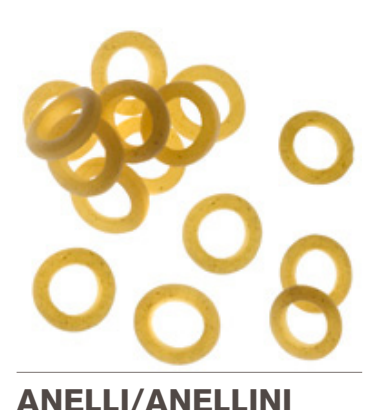
SAUCES: Pasta Salad, Soup