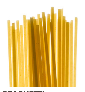
SPAGHETTI SAUCES: Baked, Butter/Oil, Cream/Cheese, Meat, Seafood, Tomato, Vegetable