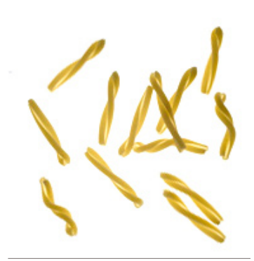
STROZZAPRETI SAUCES: Meat, Vegetable