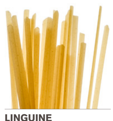
SAUCES: Butter/Oil, Cream/ Cheese, Meat, Pesto, Seafood, Tomato, Vegetable