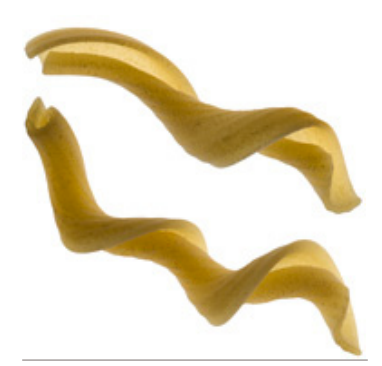
CASARECCE SAUCES: Cream/Cheese, Meat, Pesto, Seafood, Tomato, Vegetable