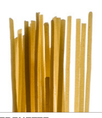
TRENETTE SAUCES: Baked, Tomato, Vegetable