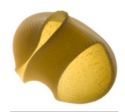
LUMACONI SAUCES: Baked, Meat, Tomato, Vegetable