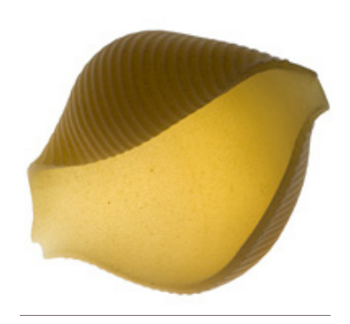
JUMBO SHELLS SAUCES: Baked, Cream/ Cheese, Meat, Tomato, Vegetable