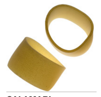
CALAMARI SAUCES: Seafood, Tomato