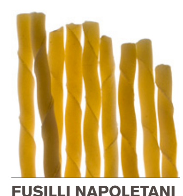
SAUCES: Baked, Butter/Oil, Cream/Cheese, Meat, Pasta Salad, Pesto, Soup, Tomato, Vegetable