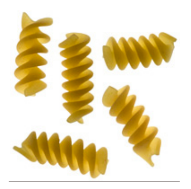
ROTINI SAUCES: Baked, Cream/ Cheese, Meat, Pasta Salad, Tomato, Vegetable