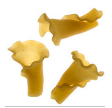
CAMPANELLE SAUCES: Butter/Oil, Cream/ Cheese, Meat, Pasta Salad, Vegetable