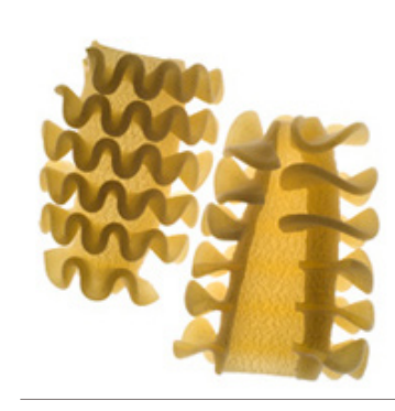
RADIATORE SAUCES: Baked, Tomato