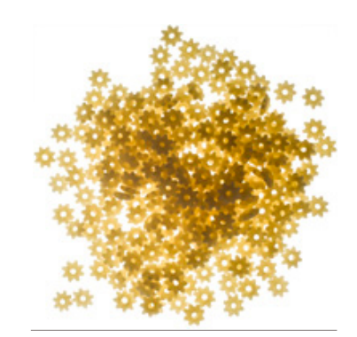
STELLINE SAUCES: Soup